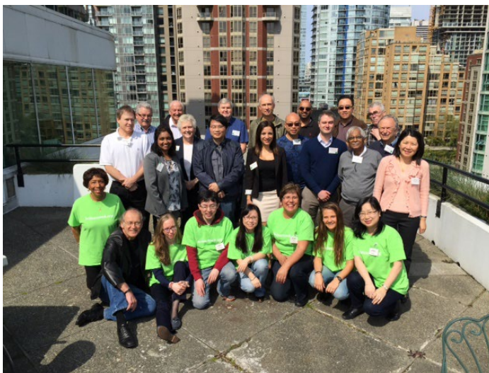
The Vancouver volunteers for "Dial-A-Lawyer Day" on April 18, 2015