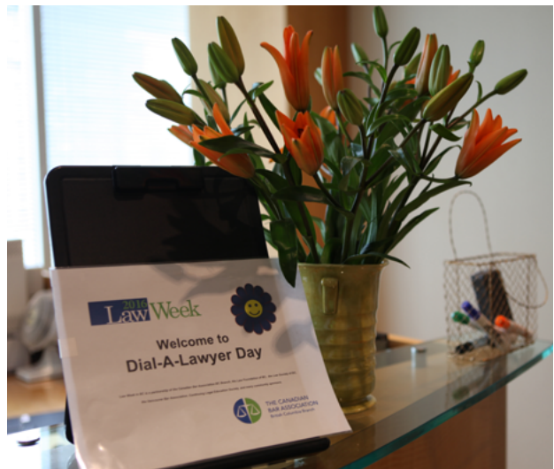
Almost 300 people called in for “Dial-A-Lawyer Day” on April 16, 2016

Volunteer lawyers assisted almost 300 people during the province-wide “Dial-A-Lawyer” event held Saturday, April 16. BC residents were invited to call and speak with a lawyer for up to 15 minutes at no cost.