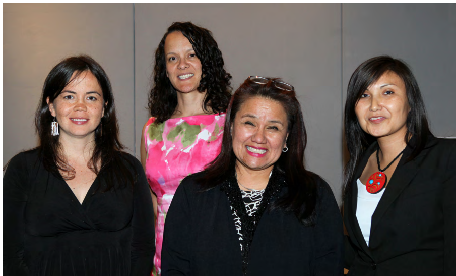
2011 Reception Attendees

This year the ALF began yet another new initiative – joining in partnership with the Department of Justice and the law firm of McDonald and Company to help organize the 4th Annual 2011 National Aboriginal Day On-Line Auction & Reception. This annual fundraiser began with the inception of the CBABC's Aboriginal Law Student Scholarship Trust and continues to raise funds toward endowing the Trust.