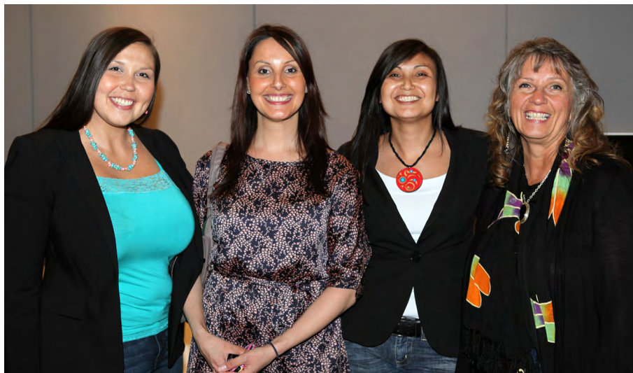
2011 Reception Attendees

This year's 2011 event once again improved on the previous year's success by raising more than $10,000! In the four years that this fundraiser has been held it has now raised more than $24,500 to assist Aboriginal law students!