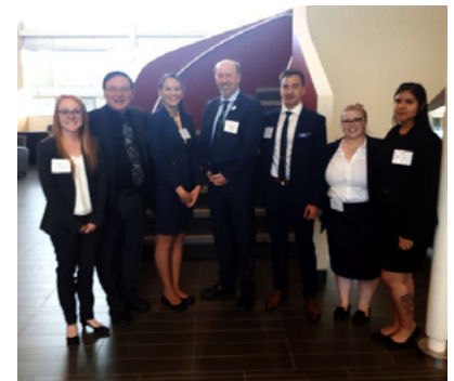
21 ILSA Members at the IITIO Trade Mission & Conference

Last year, ILSA assisted with TRU-wide indigenous events, such as “The Indigenous Women Water Defenders,” and “TRU Traditional Powwow.” We led a trip to observe the Cknúcwentn First Nations Court, which is one of the six First Nations Courts in BC. ILSA continued the tradition of organizing and facilitating the annual Truth and Reconciliation Commission days. For the first-year students, we accompanied their visit to the Kamloops Residential School, where the students were given the chance to learn about the history and legacy of residential schools in keeping with #28 of the TRC Calls to Action. The upper-year field trip to the Adams River Salmon Run also emphasized our commitment to the TRC Calls to Action, as the students had the opportunity to learn about the importance of salmon to the indigenous communities.