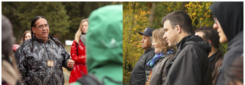
Upper year students attending Truth & Reconciliation Days at Adams River Salmon Run Inside TRU: https://inside.tru.ca/2018/10/05/salmon-run-puts-indigenous-issues-into-perspective

Since the upper-year students already took part in the TRC days to the Adams River Salmon Run this year, the next item in our agenda is organizing and facilitating the TRC debrief, in which ILSA members will pass on their knowledge and experiences from the salmon run to the first-year students. Other events in our agenda include a bannock fundraiser, a trivia night, a screening of the movie Indian Horse, a bannock-making workshop, and a panel discussion with lawyers who practise Aboriginal Law. We are also working to finalize the upcoming trip to Saskatoon to have as many ILSA members attend the Indigenous Bar Association’s 30th Annual Fall Conference: kâ wanâhtâhk isîcikewina (Systems Disruption). In short, ILSA has an eventful year ahead, and is striving to contribute to the growing indigenous presence in the legal profession.