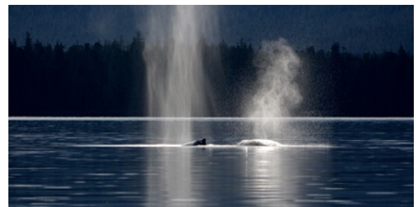
Examples of items sold at the 2018 ALF Online Auction